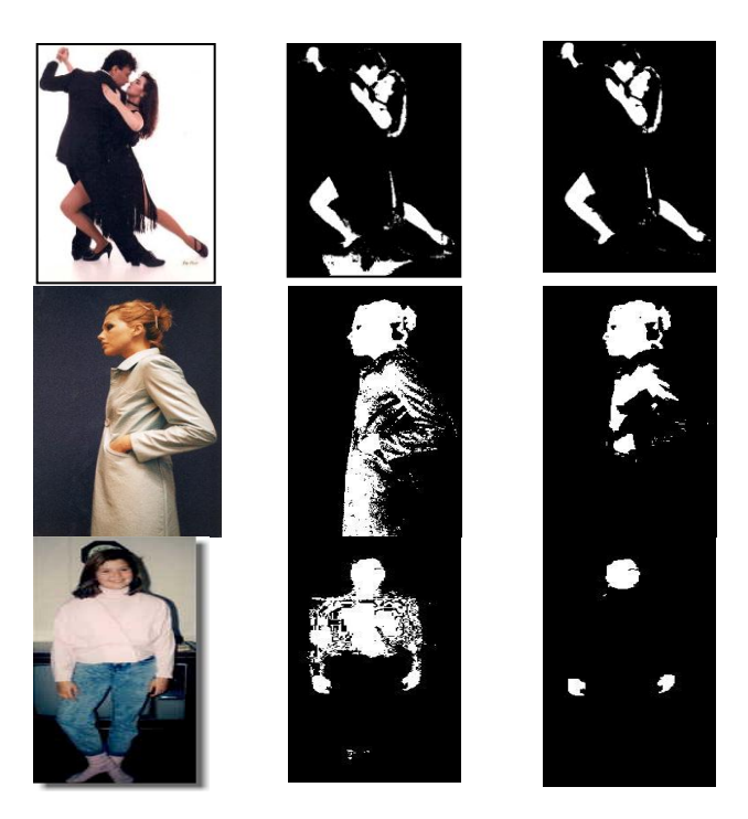
FIGURE 2: Comparison between pixel-based [2] and region-based skin color classification techniques. Left column shows the original images. Middle column shows the result of pixel-based classification technique and right column shows the result of region-based classification technique with CRF.

Table 1 shows the results for both the presented region-based technique and the current state-of-the-art pixel-based skin color detection [2] on unconstrained illumination and background. The region based technique without CRF has 91.44% true positive rate with 13.73% false positive rate and with CRF has 91.17% of true positive rate with 13.12% false positive rate. Simply grouping the pixel-based evidence onto superpixels increased the true positive rate by 1.44% and decreased the false positive rate by 0.48%. This shows treating skin as a region yields better results than using pixels only. Both results from the region-based techniques are better than the pixel-based technique.