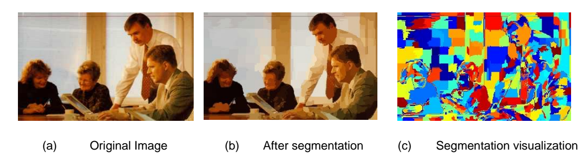
FIGURE 1: An example of superpixel segmentation. A five dimensional vector is used to extract the superpixels: three RGB color channels and two positional coordinates of the pixel in the image.

The presented technique not only outperforms the current state-of-the-art pixel-based skin color detection techniques but also extracts larger skin regions while still keeping the false-positive rate lower (see Table 1 and Figure 2), providing semantically more meaningful skin regions. This could in turn benefit higher-level vision tasks, such as face, hand or human body detection. Related work is discussed in section 2; section 3 presents the proposed region-based skin color detection technique; experiments and results are discussed in section 4. Finally, we summarize our work in section 5.